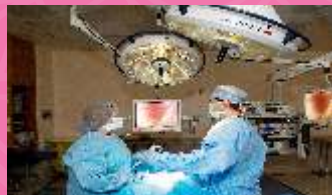
ADVANCE GYNEC ENDOSCOPY CENTRE