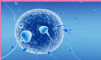
IUI - IVF - ICSI TEST TUBE BABY CENTRE