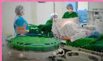
HIGH RISK PREGNANCY UNIT