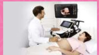
ADVANCE FETAL MEDICINE CENTRE